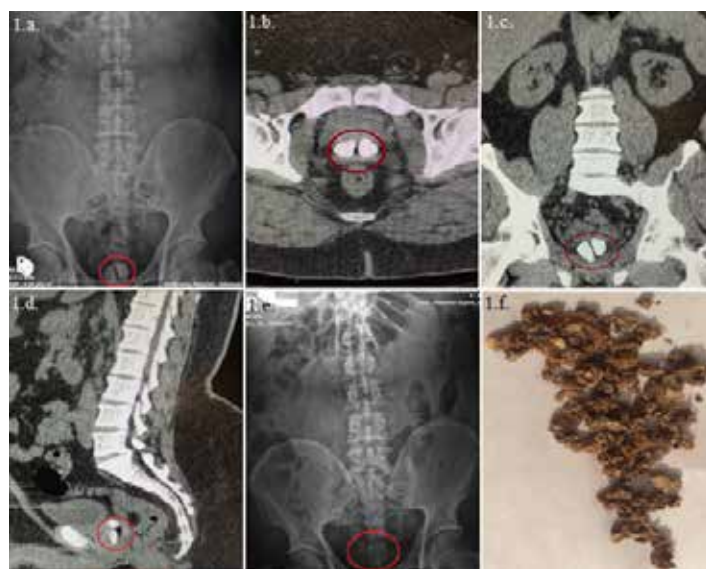
Figure 1. a. KUB showing giant prostatic urethral stones (preop), b.,c.,d. Unenhanced CT scan showing gland with giant stones., e. KUB : postop stone free image, f. Postop fragmented Stones

urethra was open. After surgery, a urethral catheter was placed. After the urethral catheter was taken on the postoperative second day, the patient voided with a good stream. During the first month of operation, the patient had no complaints regarding his voiding pattern. His urine culture remained sterile. Ultrasonography and X-ray examinations revealed no remaining calculi in the lower urinary tract. His post-operative period was uneventful and he was started on alpha-1A blocker in the postoperative period because of his uroflowmetric patterns and international prostate symptom score. His average flow was 10.7ml/sec and maximal flow was 14.3 ml/sec. His international prostate symptom score was 14. We did not take uroflowmetry measurement before the operation because of urethral stones and the patient urinating drop by drop. At follow-up during the first month after the surgery, the patient emptied with a good stream.